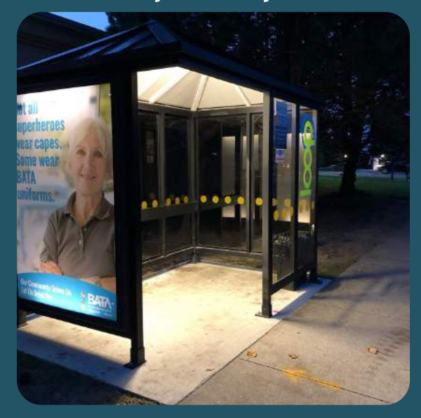
8th & Rose : Route 2 & 14